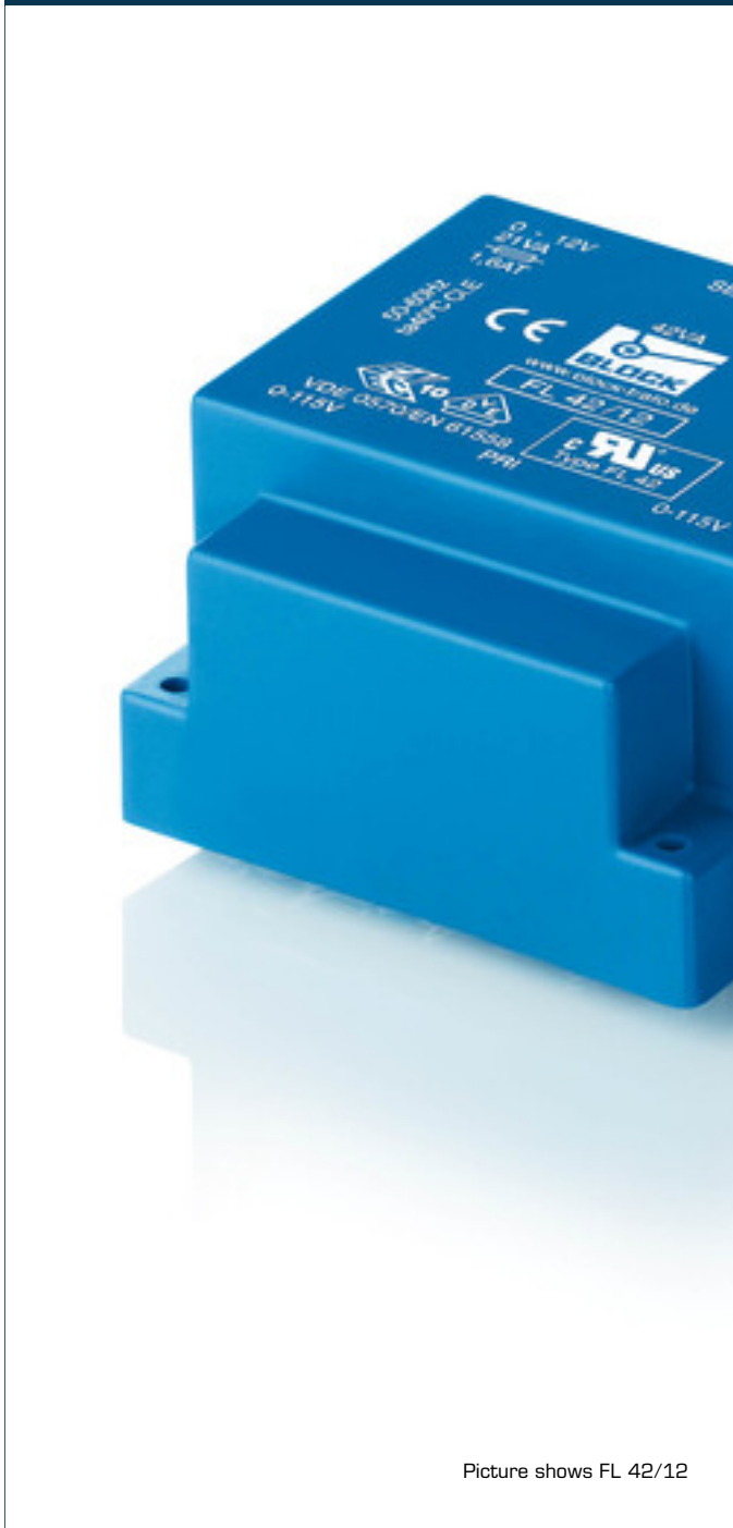
Picture shows FL 42/12