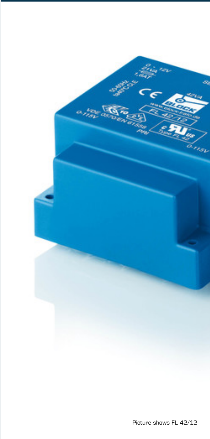
Picture shows FL 42/12