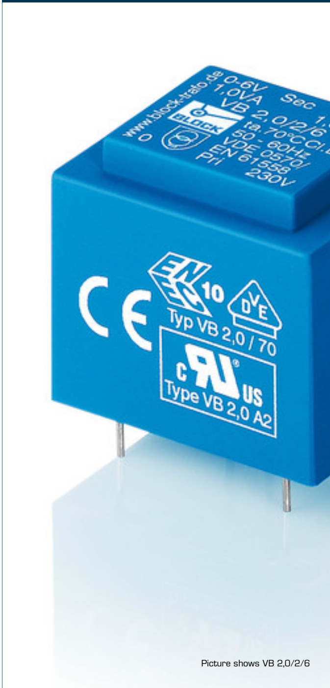
Picture shows VB 2,0/2/6