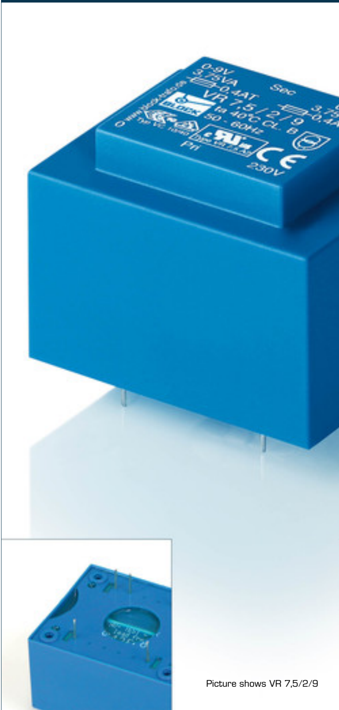
Picture shows VR 7,5/2/9