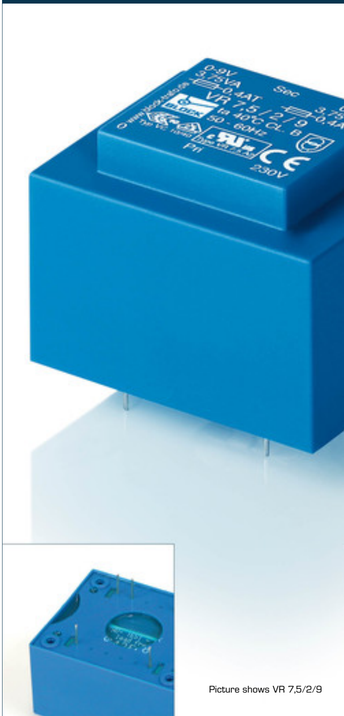
Picture shows VR 7,5/2/9