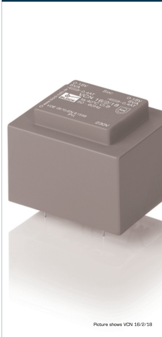
Picture shows VCN 16/2/18