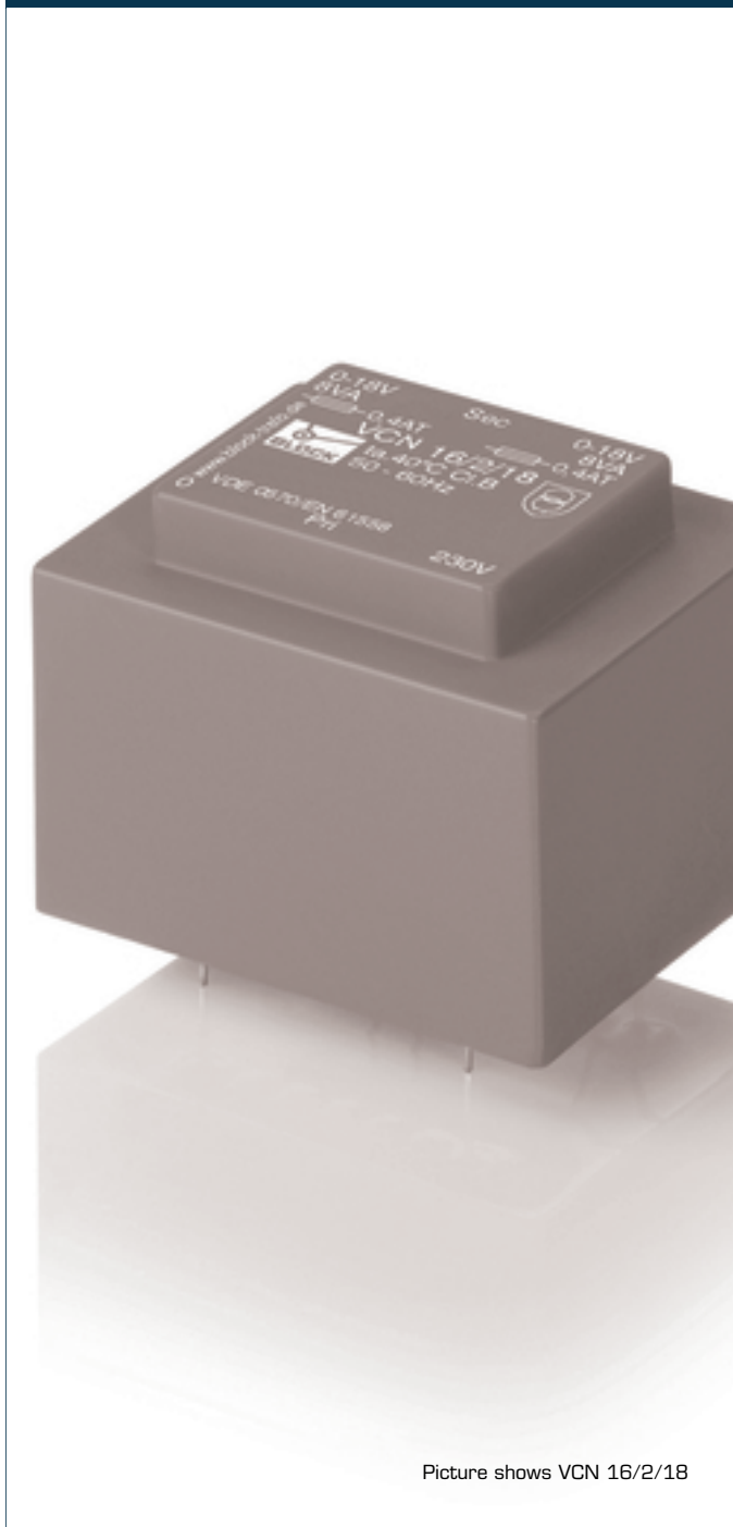
Picture shows VCN 16/2/18