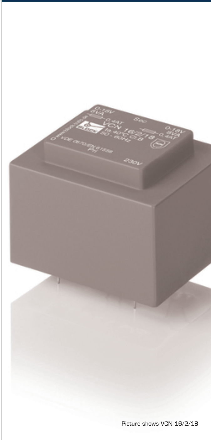
Picture shows VCN 16/2/18