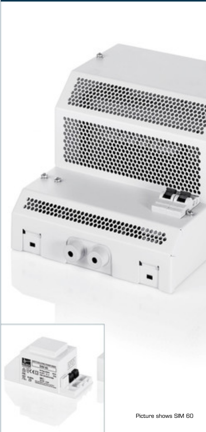
Picture shows SIM 60