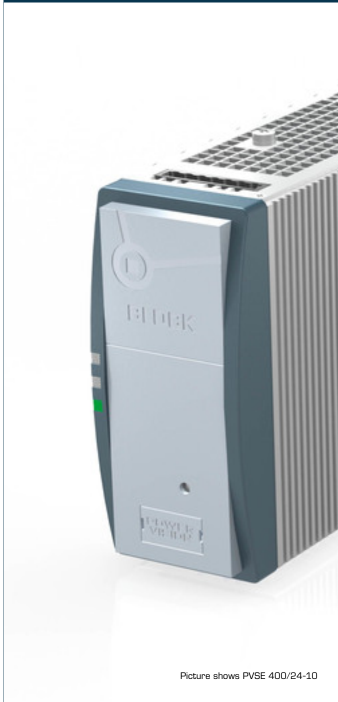
Picture shows PVSE 400/24-10