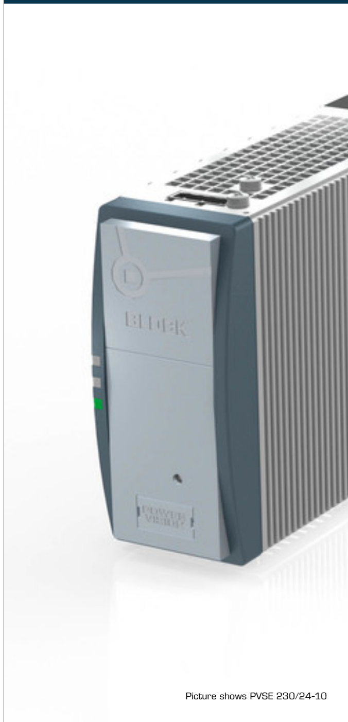
Picture shows PVSE 230/24-10