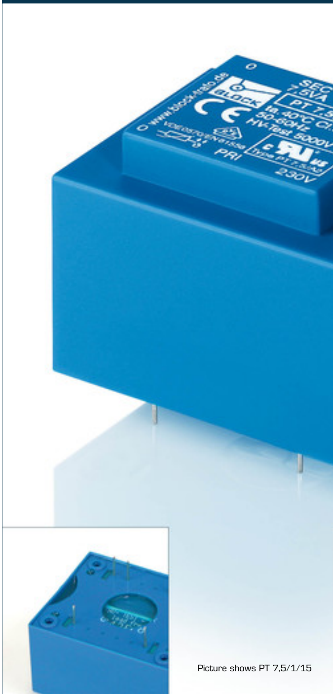
Picture shows PT 7,5/1/15