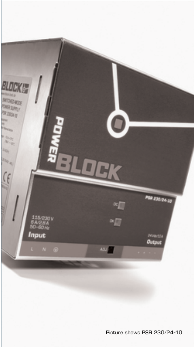
Picture shows PSR 230/24-10

Primary switch mode power supply is concentrated on the core task of voltage and current supply.