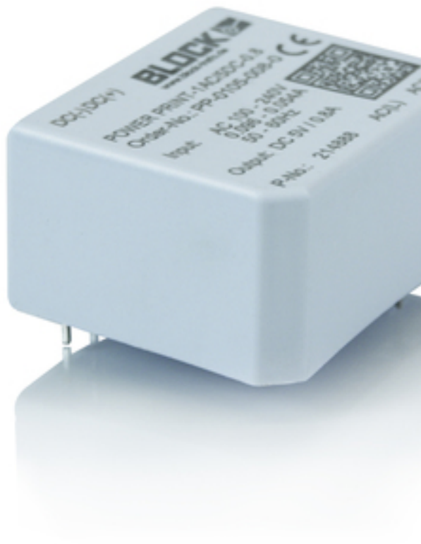
Picture shows PP-0105-008-0

Switching power supply with excellent efficiency and low no-load losses for direct soldering to the PCB. Provides an extremely space-saving design of various applications.