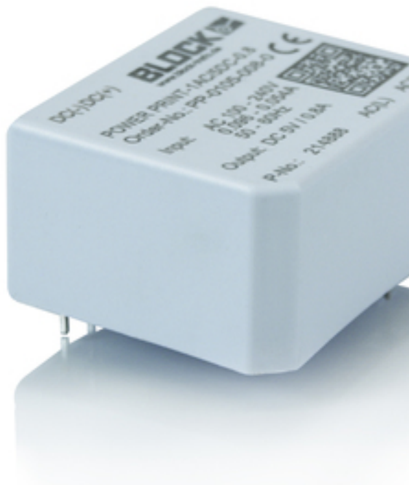
Picture shows PP-0105-008-0

Switching power supply with excellent efficiency and low no-load losses for direct soldering to the PCB. Provides an extremely space-saving design of various applications.