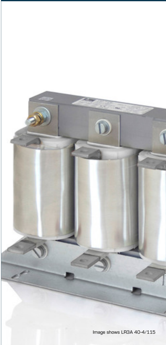
Image shows LR3A 40-4/115