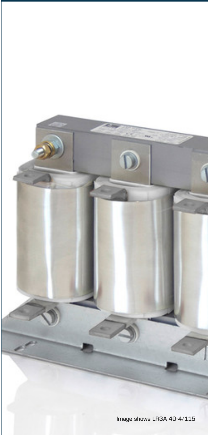
Image shows LR3A 40-4/115