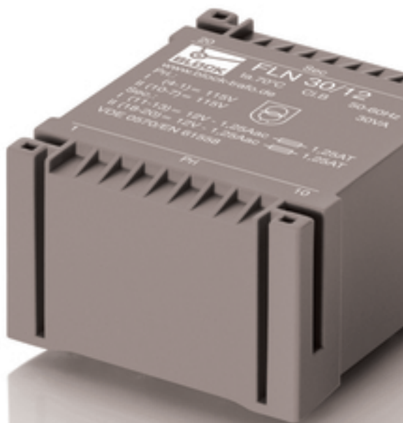
Picture shows FLN 30/12