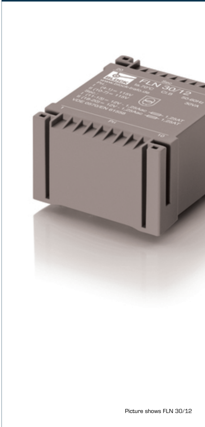
Picture shows FLN 30/12