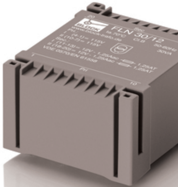
Picture shows FLN 30/12