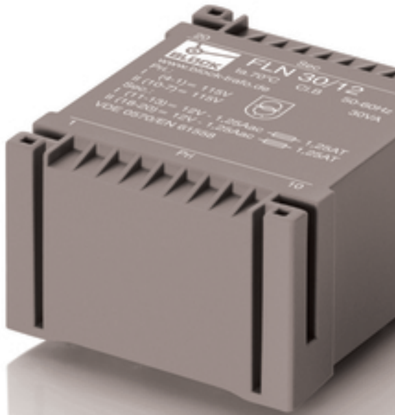
Picture shows FLN 30/12