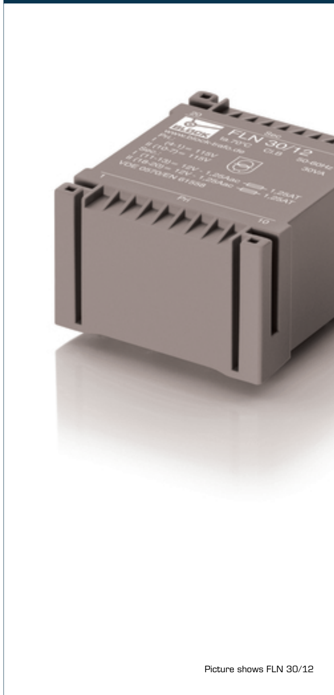
Picture shows FLN 30/12