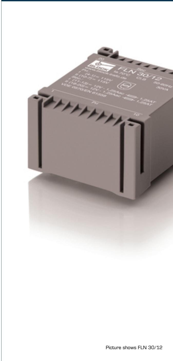
Picture shows FLN 30/12