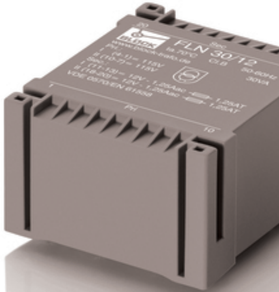
Picture shows FLN 30/12