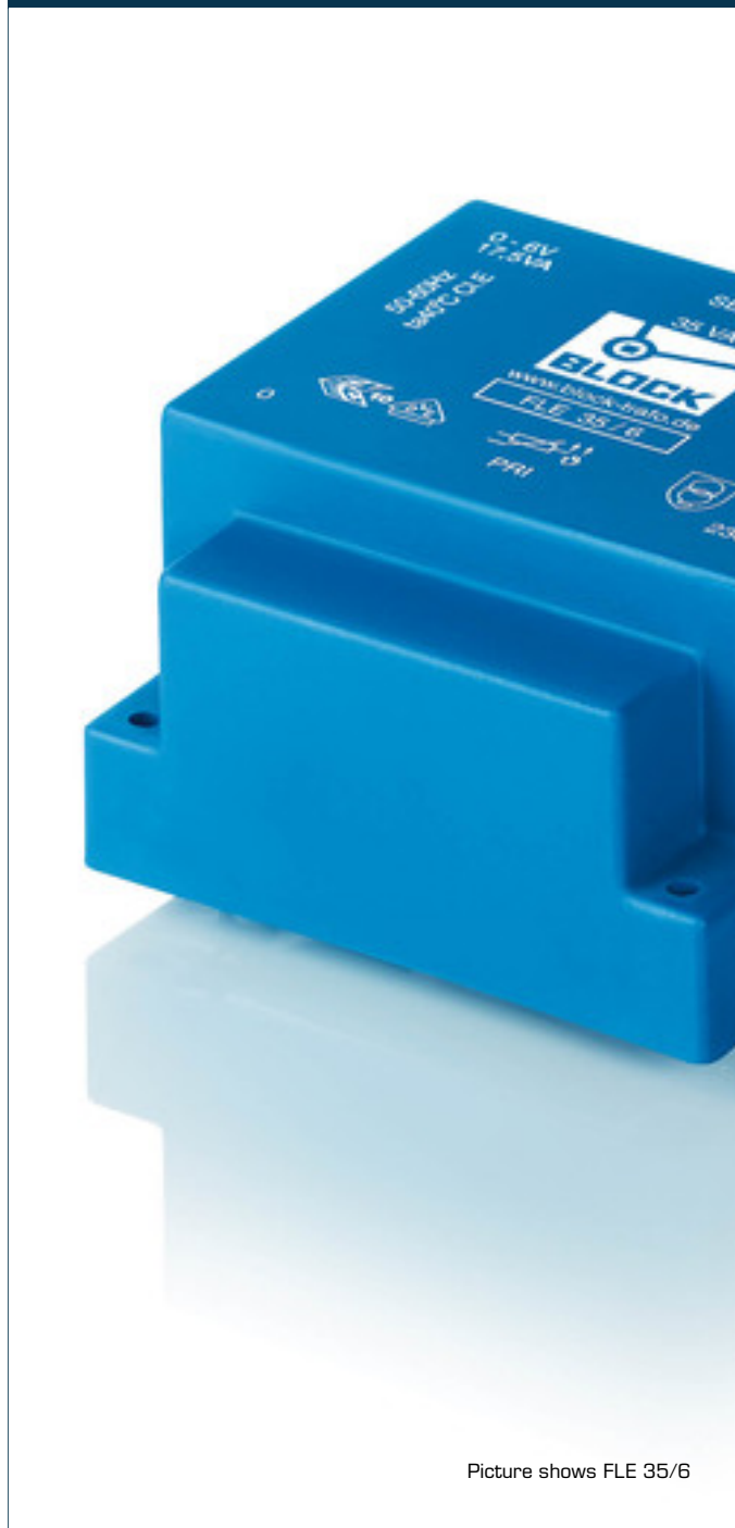
Picture shows FLE 35/6