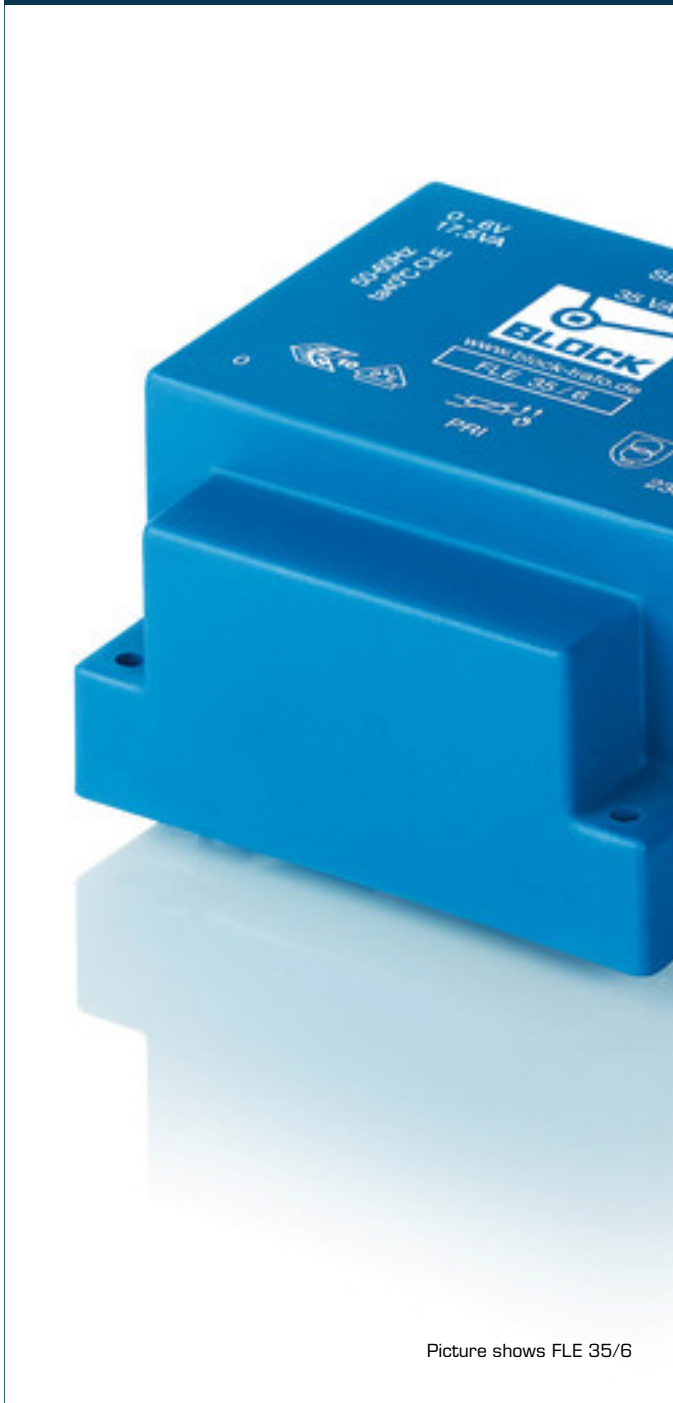
Picture shows FLE 35/6