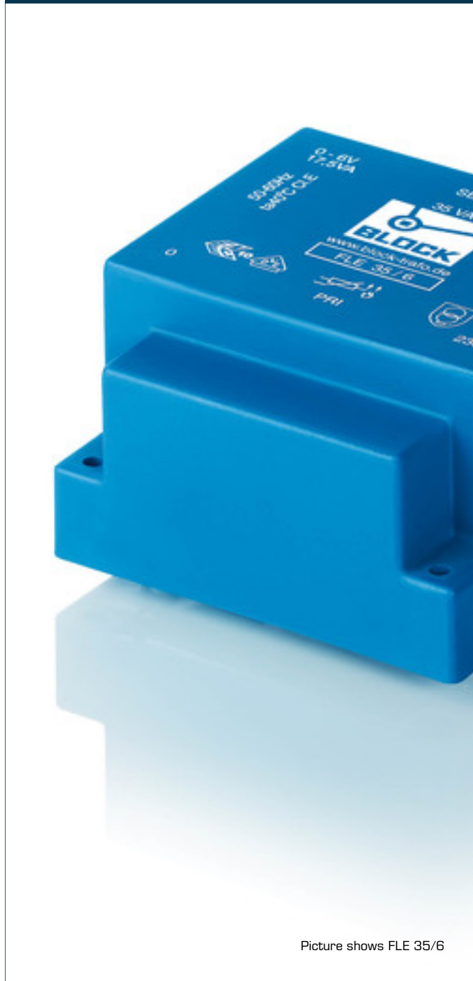
Picture shows FLE 35/6