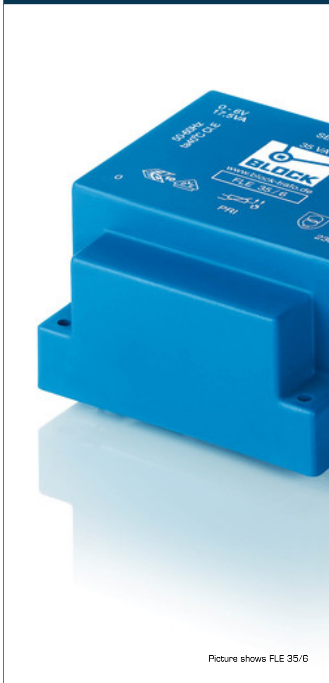
Picture shows FLE 35/6