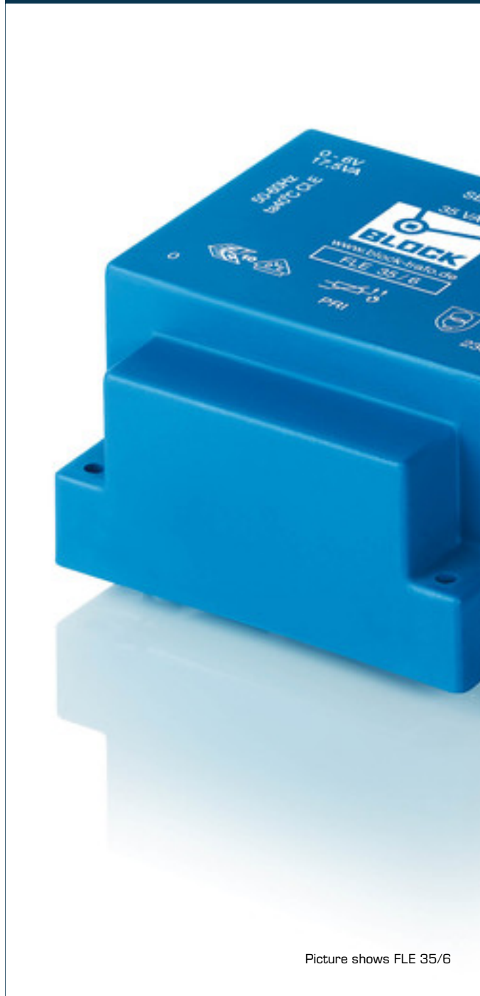
Picture shows FLE 35/6