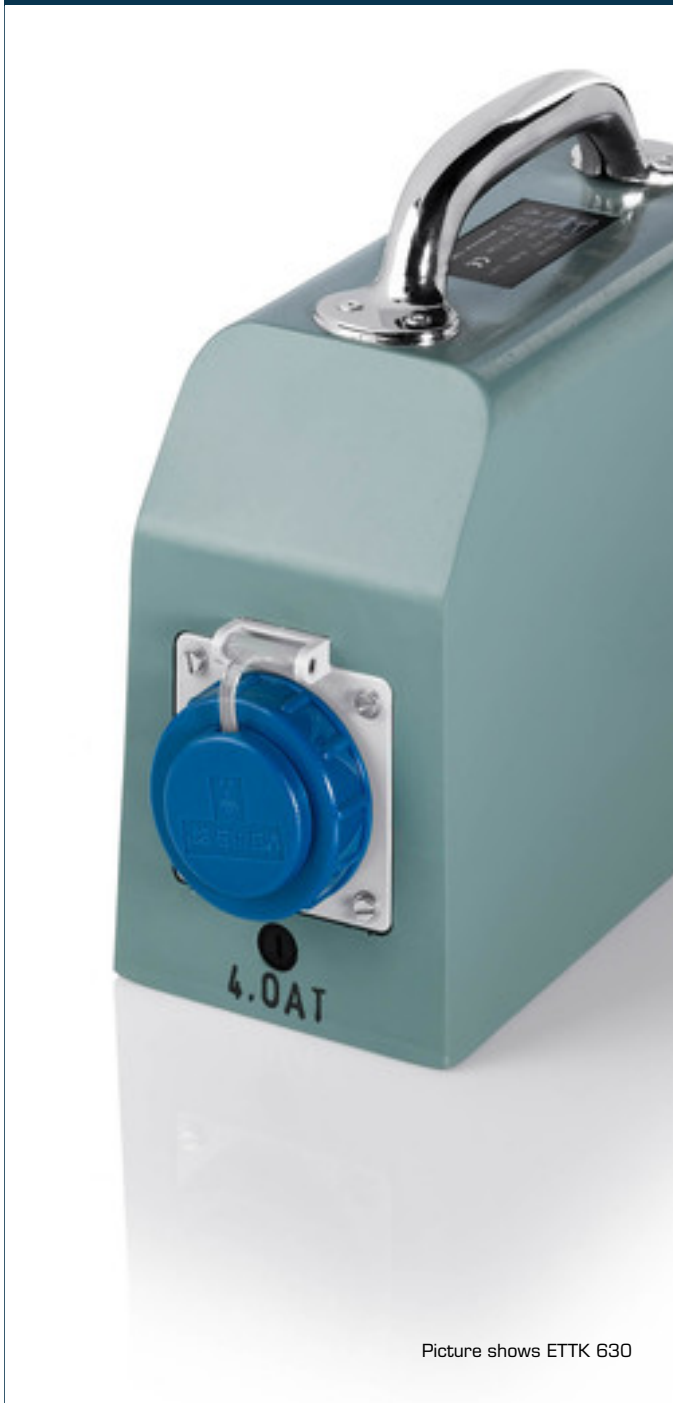
Picture shows ETTK 630