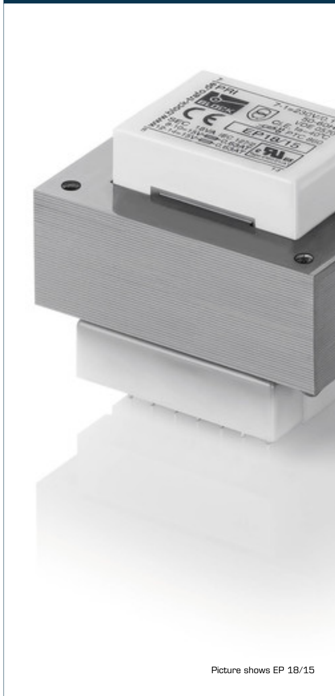
Picture shows EP 18/15