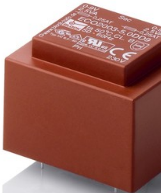
Picture shows ECO2003-5,0-DD9