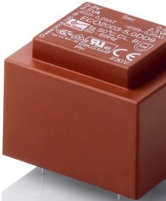
Picture shows ECO2003-5,0-DD9