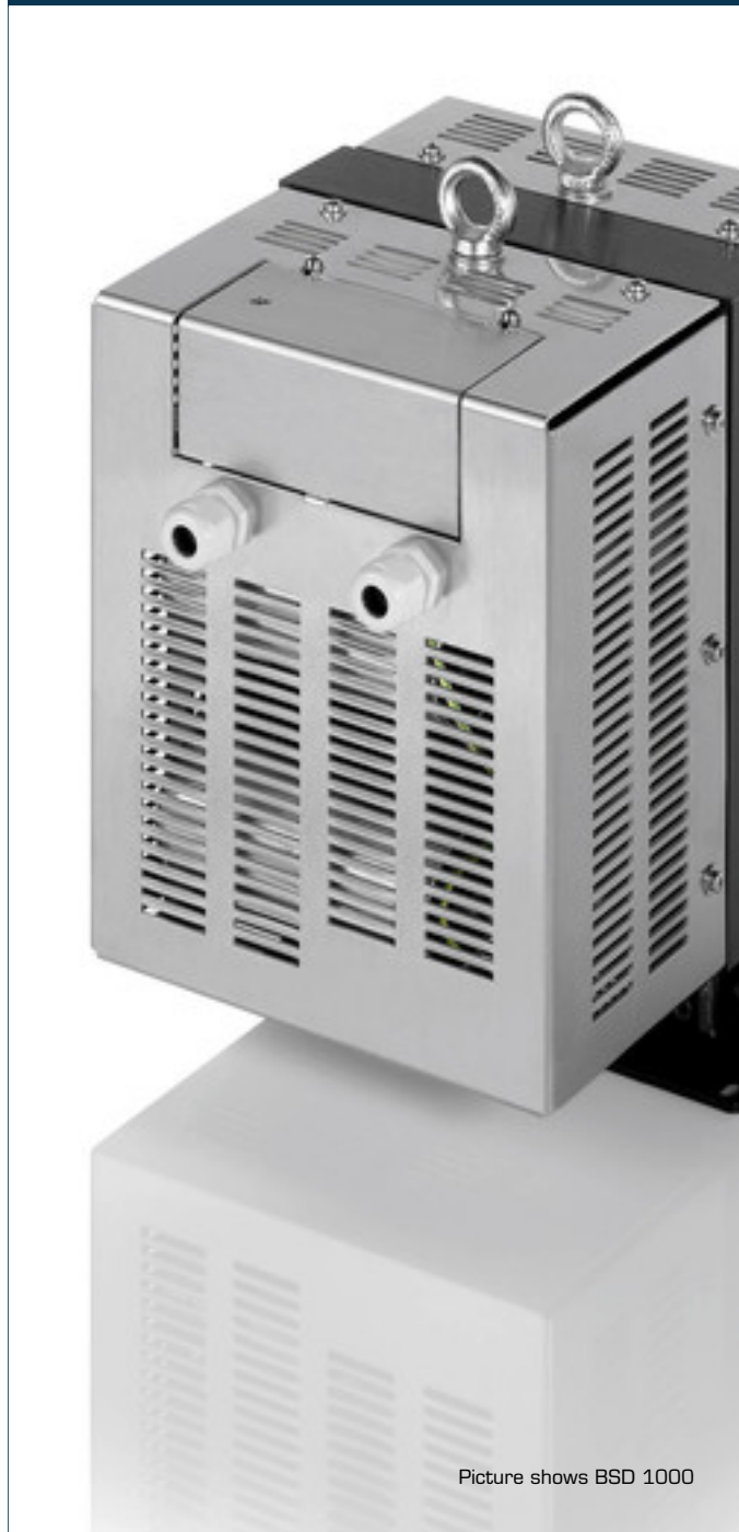
Picture shows BSD 1000