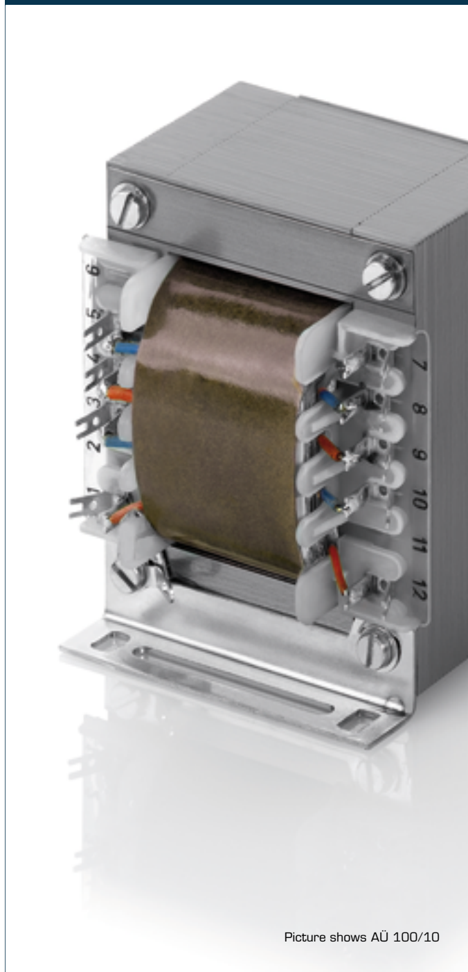
Picture shows AÜ 100/10