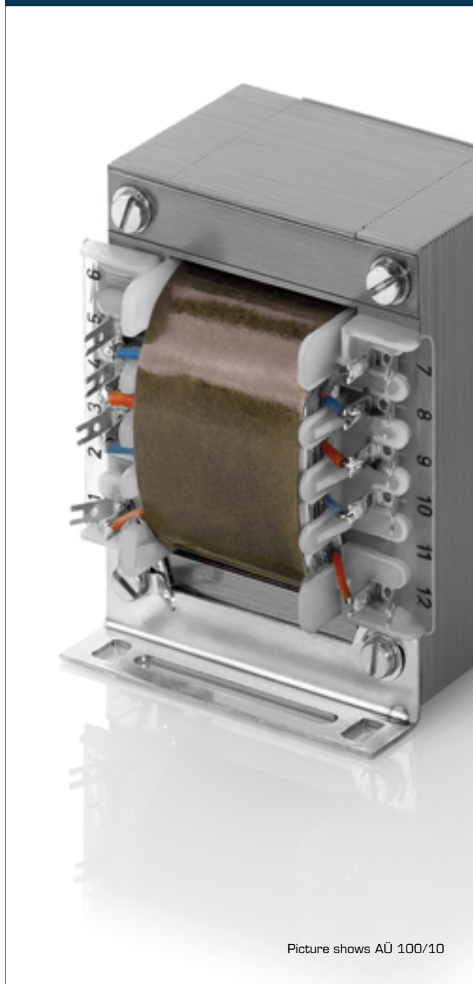
Picture shows AÜ 100/10